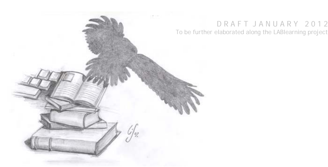
Freeing learning capacity and fostering new

This part of the Lessons Learned produced by the EU LABlearning project represents a synthesis of what we know about media based learning. The second part represents practical experience from laboratory and media based learning for youth at risk.